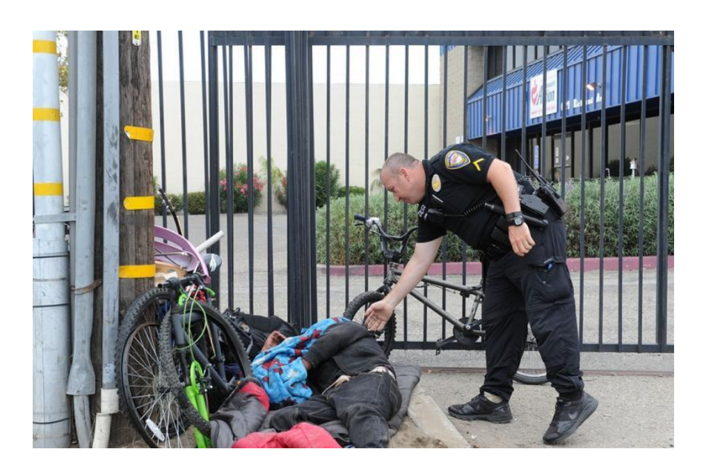
An Oxnard Police Officer with an unsheltered homeless couple

The issue of homelessness in Oxnard has escalated into a community wide health and safety issue. The Oxnard Police Department has shouldered the brunt of this issue through resources and many calls for service. As well, City parks, businesses and the community have been heavily impacted by this crisis. We are now at a stage where we can implement a Five Year Plan and Strategy to address the issues through comprehensive services, housing programs and effective outreach practices that will give us the edge for addressing chronic homelessness in Oxnard. Specifically, the Year-Round Shelter strategy is the prong towards getting people off the streets. It will allow us the opportunity to build sustainable homeless entry and exit systems that will create the needed pathways to end homelessness. The other elements with mental health services, bridge and long-term housing solutions are equally critical towards effectively addressing homelessness in Oxnard.