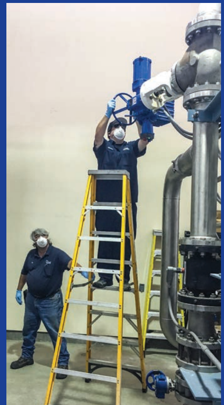
State-certified water treatment operators perform routine maintenance to keep operations reliable.